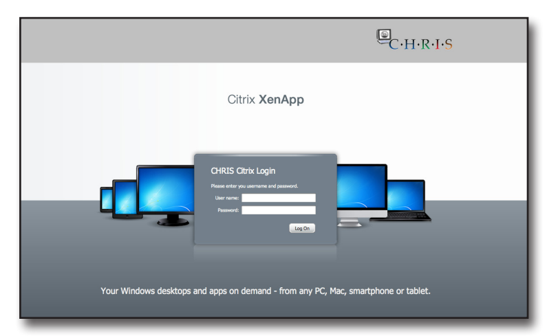
Figure 3: New Citrix Login Page