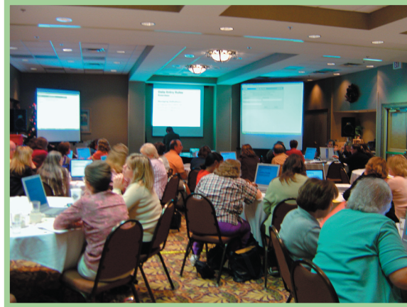
Data Facilitators in training session.

Last summer, we announced that all CHRIS Database Administrators (DBAs) would take on the new title of CHRIS Data Facilitator. To welcome the new data facilitators, a statewide training was held on December 6-7, 2004 at the Embassy Suites Orlando Airport Hotel. Forty-eight representatives attended, including data entry personnel, managers, and existing DBAs.