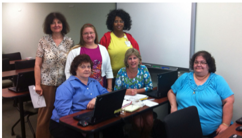
New User Training FDLRS/Crown