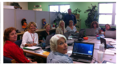
New User Training FDLRS/Alpha