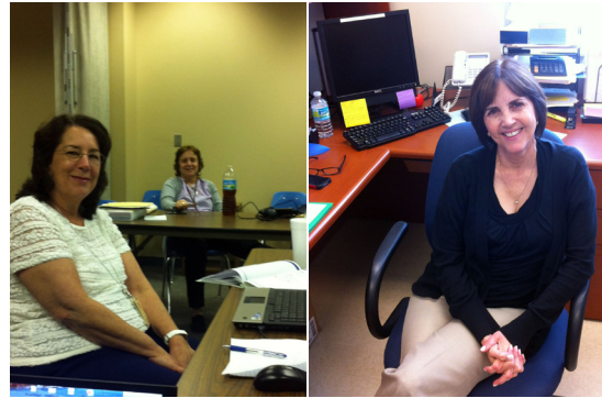
New User Trainings FDLRS/Alpha, FDLRS/South