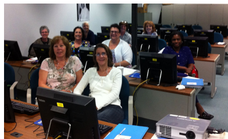
New User Training FDLRS/East