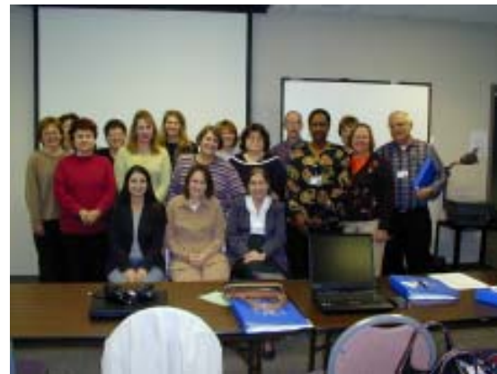
FDLRS/Crown Associate Center