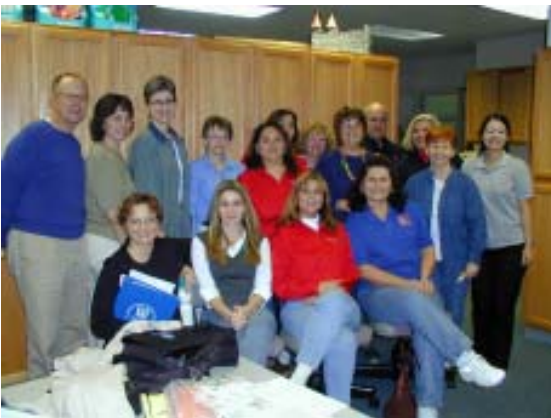
FDLRS/Sunrise Associate Center