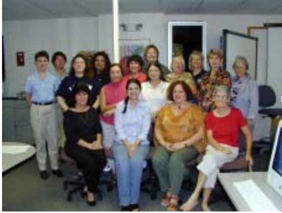
FDLRS/Sarasota Associate Center

Last Fall, we began a CHRIS Plus New User Training Tour targeted at all of our CHRIS users. We visited 12 centers around the State. All of the trainings were a success and we would like to thank the center managers, DBAs, and staff that assisted in coordinating these sessions.