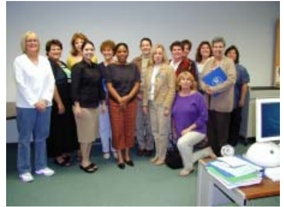
FDLRS/East Associate Center