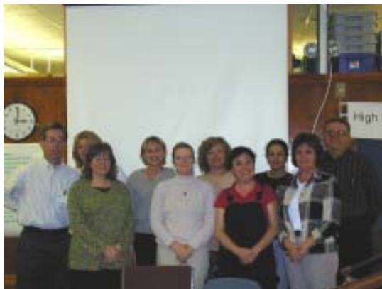
FDLRS/Gulfcoast Associate Center