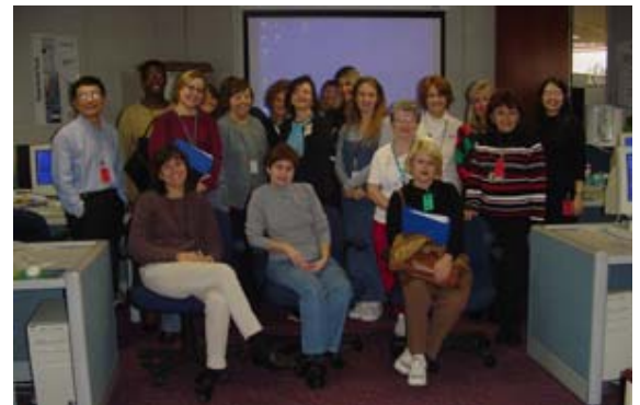
FDLRS/Action Associate Center